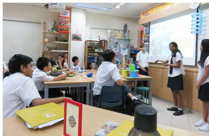
Reflecting and communicating the experience after visiting the Singapore Maritime Gallery