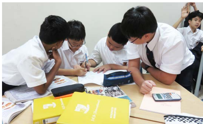
Collaborating to summarise and create a mindmap