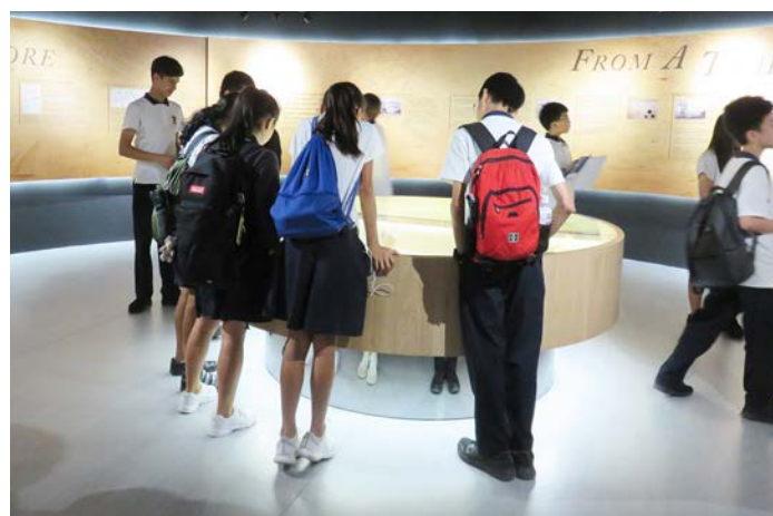
Self-directed learning at the Singapore Maritime Gallery (Former Ford Factory Museum)