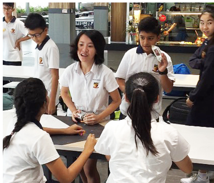
Role-playing the traders in Temasek who were bartering goods

The photos below show some of the trips/activities they have made/participated in.