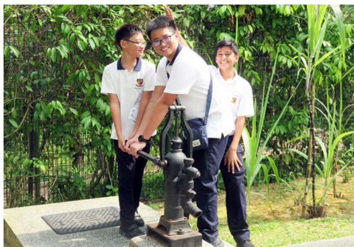
Trying out a handpump that extracted well water during the Occupation of Singapore (Former Ford Factory Museum)