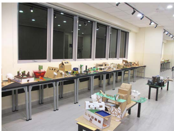
Exhibition of Year 1 Architectural Models