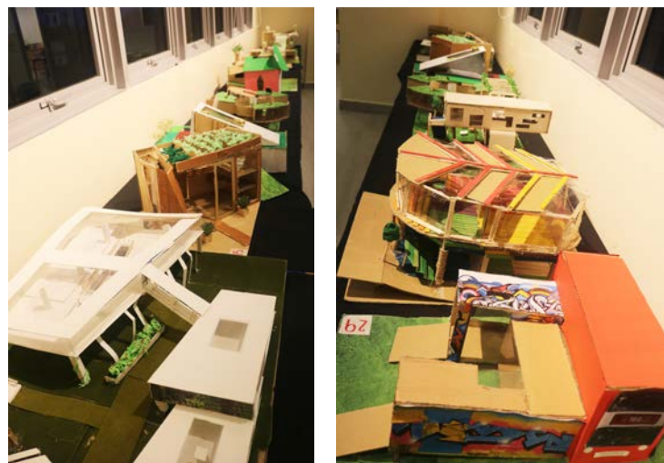
Other Winning Entries