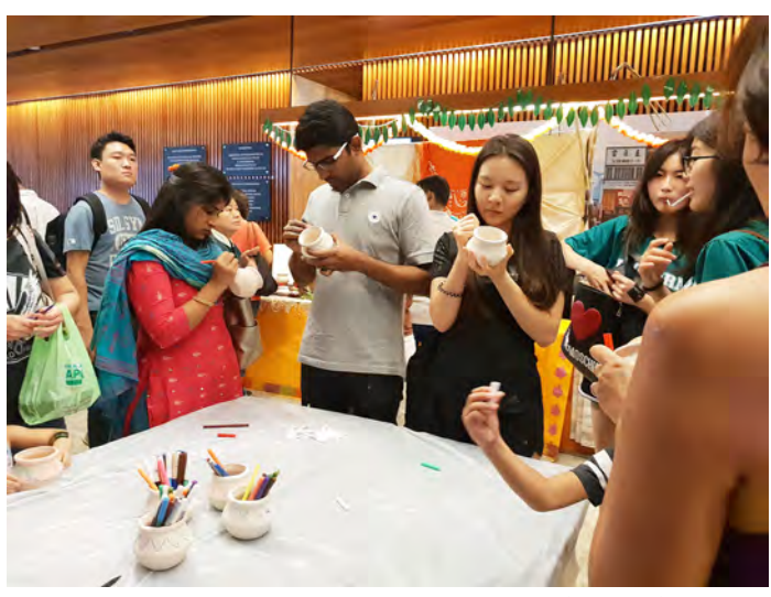
Pongal Festival Activities