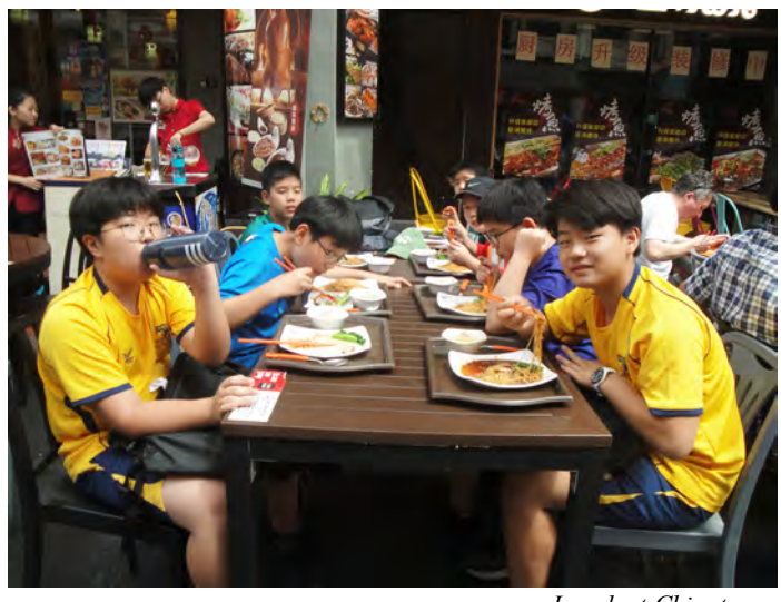
Lunch at Chinatown