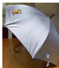
Long Umbrella - S$20.00