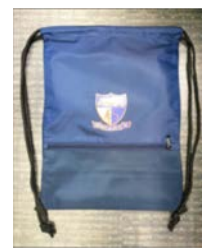
Drawstring Sport Bag - S$10.00