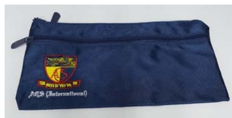
Pencil Case - S$6.00