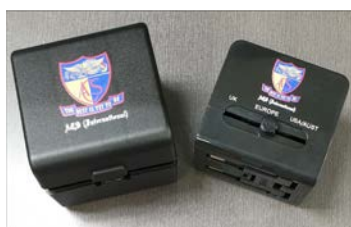
Travel Adaptor - S$15.00