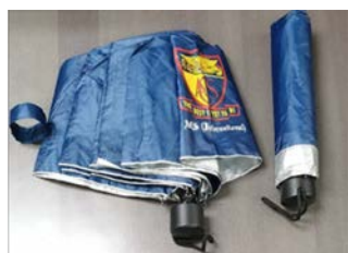
3-Folded Umbrella - S$12.00