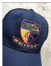
Cap - S$5.00

Please proceed to the General Office reception during office hours to purchase any of these items. Only cash or cheque payments are accepted.