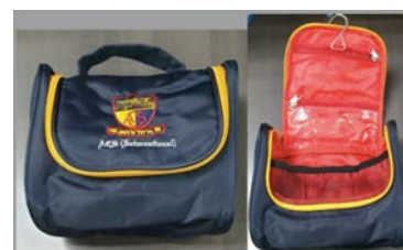
Travel Pouch - S$10.00