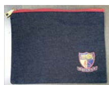
Denim Pouch - S$7.00