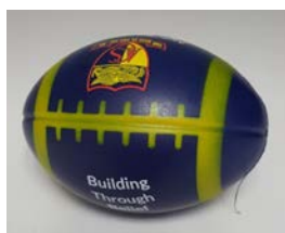
Stress Ball - S$2.00