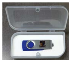
64GB Flash Drive - S$20.00