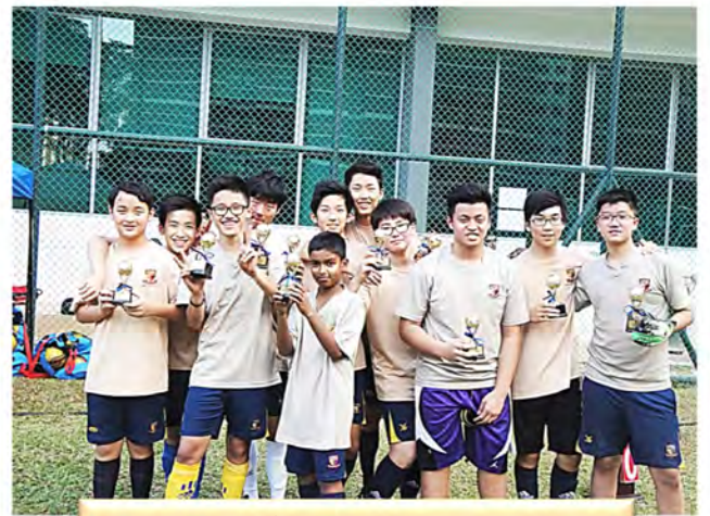
TCT - Winners of the Junior Football Competition