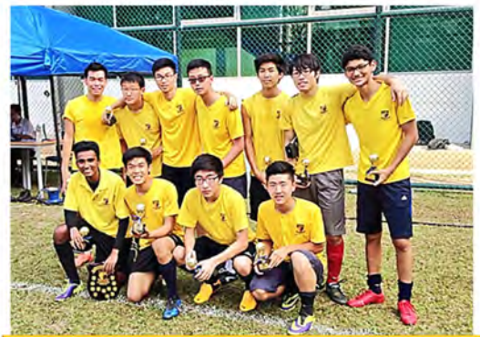
GHK - Winners of the Senior Football Competition