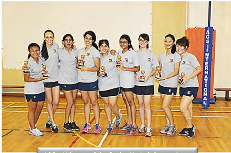
LSG - Winners of the Senior Netball Competition

TCT came top in the Football Competition, well done!