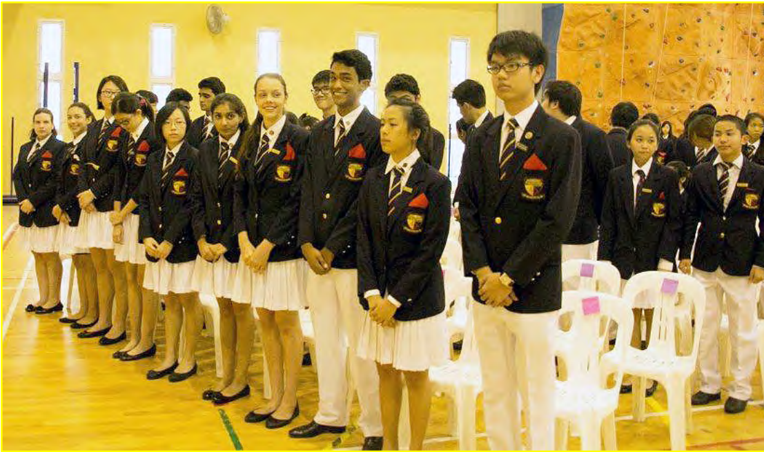
The 9th Prefectorial Board who had served the school with distinction