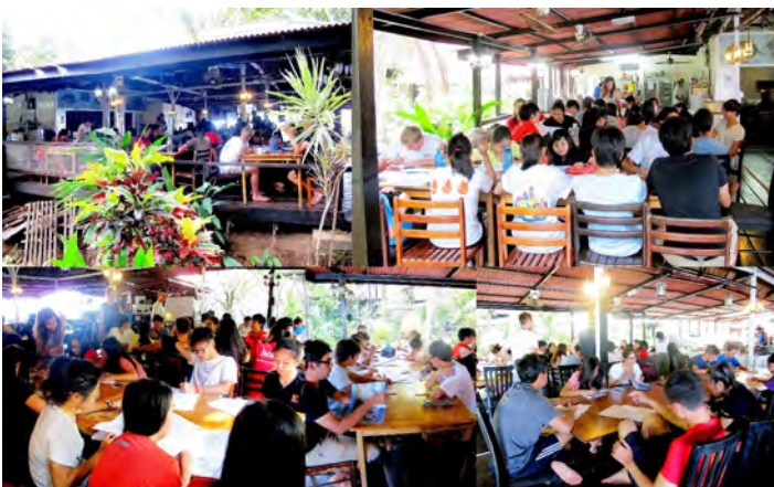
Data Analysis & Processing