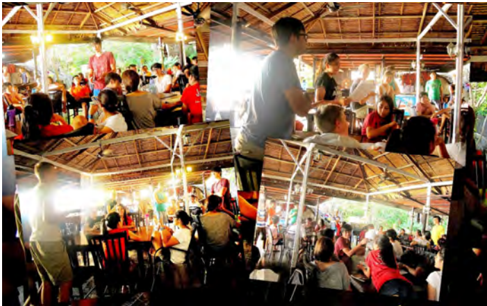
Debate on Golden Frog