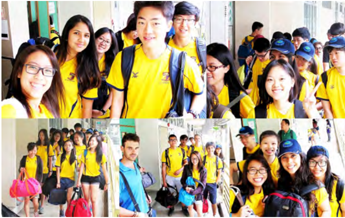
Students Depart from school