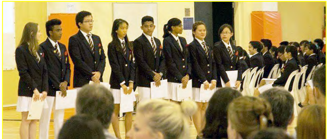
The 2013-2014 House Captains who had led with passion and commitment