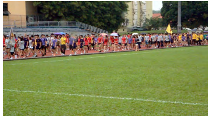
ACS (International) as a team

The challenge helped raise funds and awareness of the large number of people living in poverty, and of those who unfortunately do not have the opportunity to live comfortably. Thus, it was an enjoyable and excellent way of offering our support not only to the organisation, but to those in need as well.