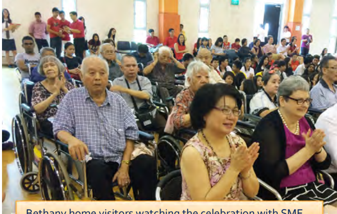
Bethany home visitors watching the celebration with SME

On the 13 January, as part of our Lunar New Year celebration and partnership with Methodist Welfare Services, our school played host to ten elderly visitors from Bethany Home.