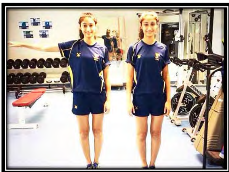
Year 5 Sports Science students using the 'Split Pic' Application to illustrate joint articulation during a practical lesson.