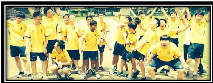
Year 3 students reactions to completing an endurance challenge during a PE lessons. Students ran an average of 2.8 km during the lesson and gained knowledge of heart rate and recovery times.