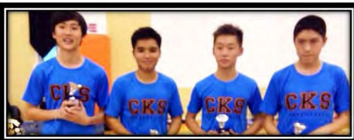
CKS took the overall top prize for the 2014 Inter-House Badminton Tournament. CKS sported some outstanding players, which helped them retain the trophy from last year. Congratulations!