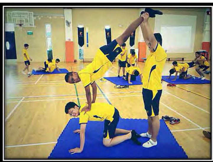
Year 2 students engaging in a trust and balance exercise during the 'Indoor Games' Unit of Work. During this unit, students learned how to identify their own strengths and weakness and then apply specific skills to overcome challenges.