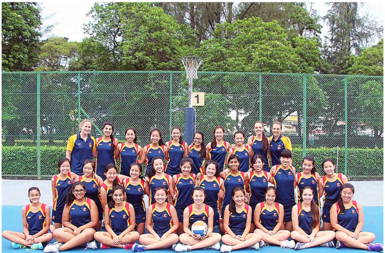
Our U19 Girls Netball Teams

In the Australian International School Cup to date the boys have drawn 2 – 2 against the German European School and lost 1 – 3 to the Singapore American School. Two more matches against the Lycée Français de Singapour and the Australian International School will be followed by the semi-finals and finals.