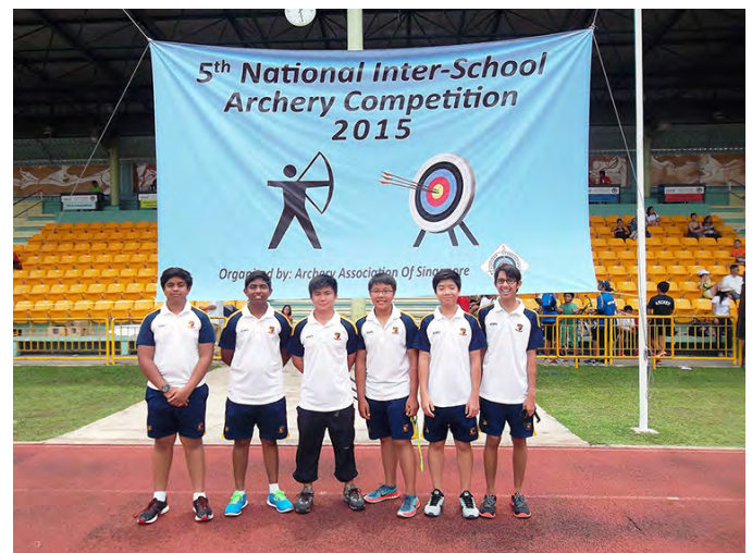
B Division Team Left to Right: