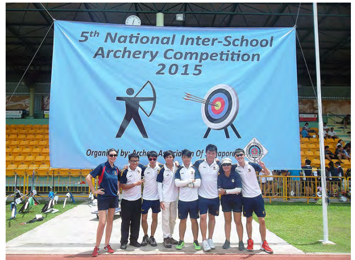
A Division Team Left to Right: