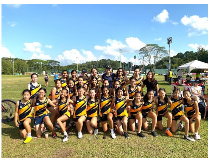
U14 and U16 Teams

Despite the heat and the intense competition, we stuck together as a team and motivated each other to keep going. Our parents provided excellent support and provided us with food and snacks to keep us going and pumped up with energy. Having said that, our tactics and awareness of the match not only improved, but our bonds as a team grew stronger.