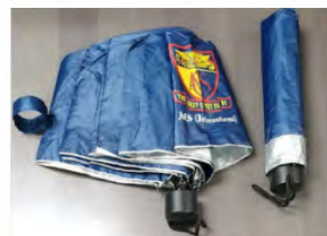
3-Folded Umbrella - S$12.00