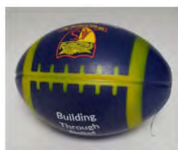
Stress Ball - S$2.00