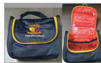
Travel Pouch - S$10.00