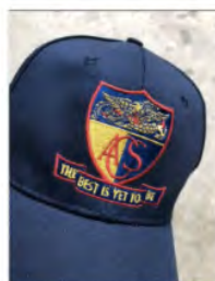
Cap - S$5.00

Please proceed to the Reception during office hours to purchase any of these items. Only cash or cheque payments are accepted.