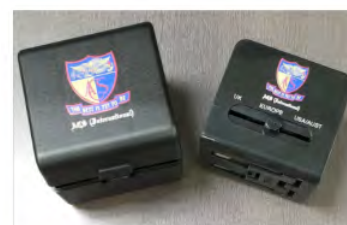
Travel Adaptor - S$15.00