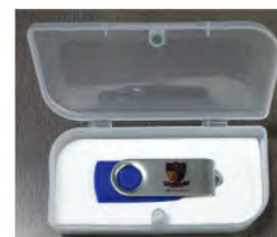
64GB Flash Drive - S$20.00