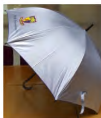
Long Umbrella - S$20.00