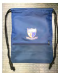
Drawstring Sport Bag - S$10.00