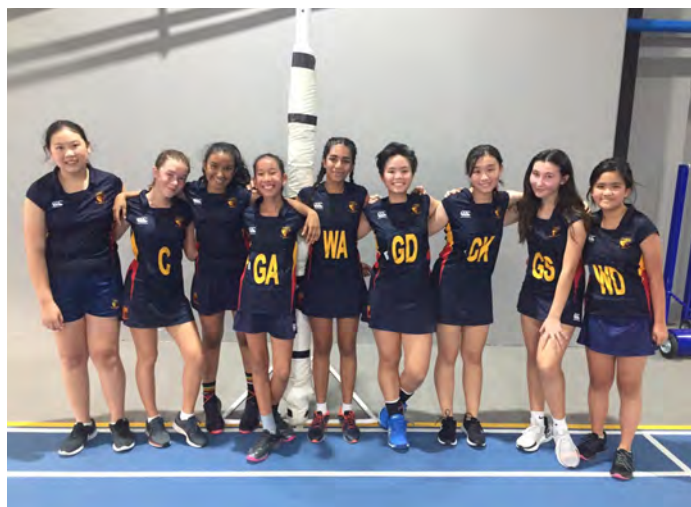
U14 Netball A team 2020