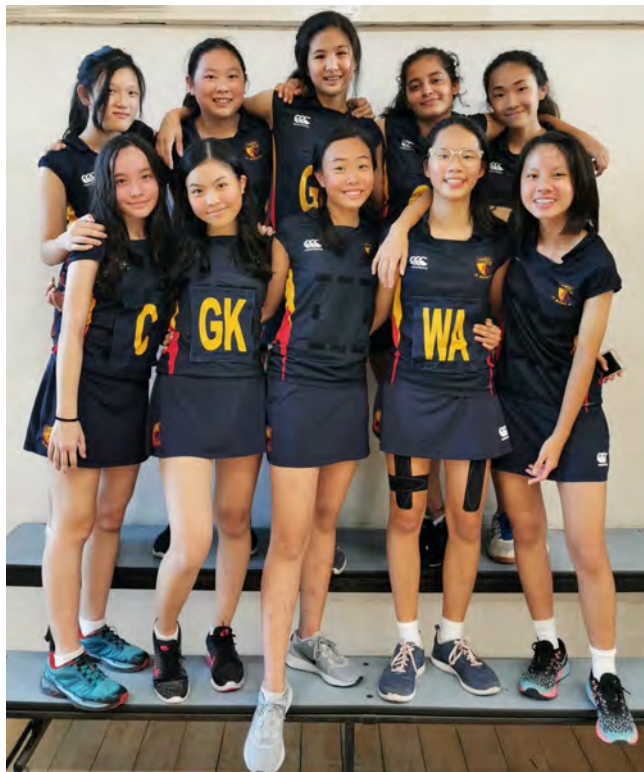
U14 Netball B team 2020