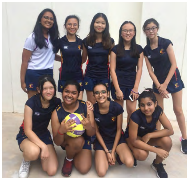
U14 Netball C team 2020