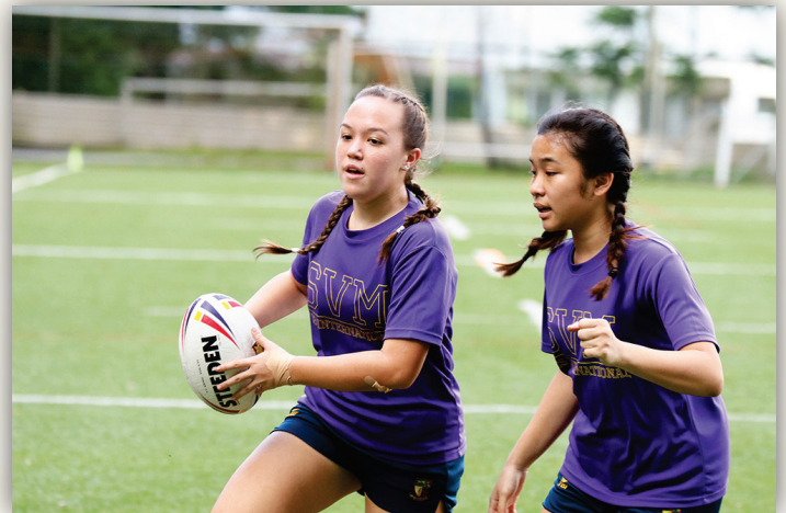
Inter-House Girls Touch Rugby - SVM in possession