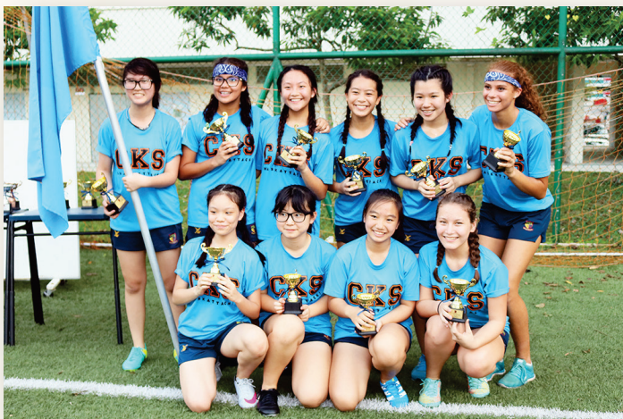
Inter-House Junior Girls Touch Rugby - Champions CKS