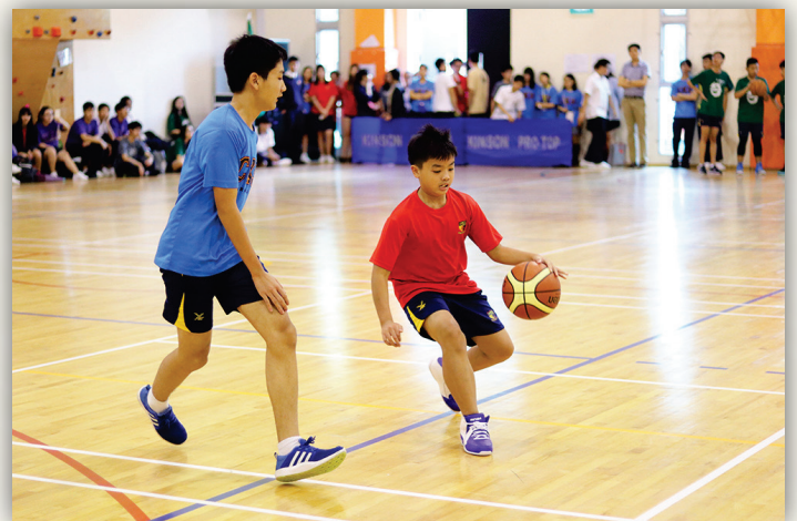
Inter-House Junior Boys Basketball