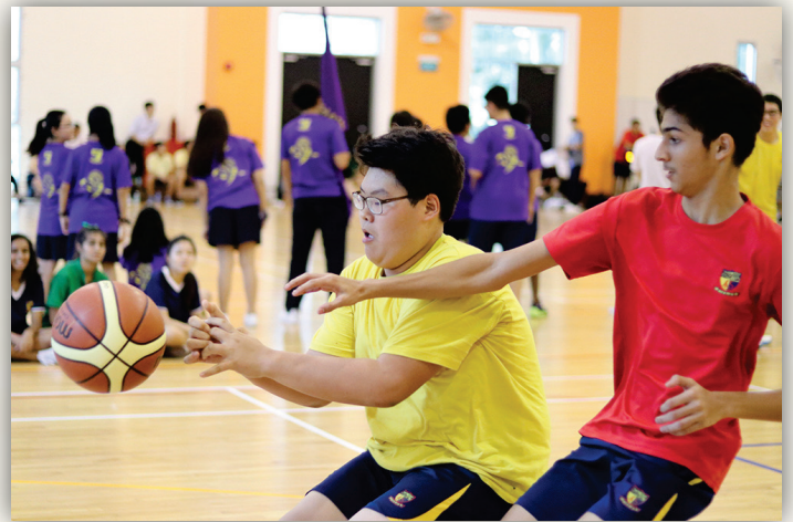
Inter-House Boys Basketball