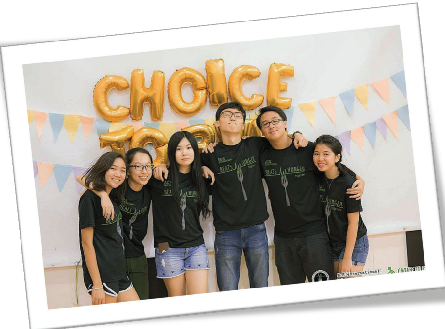
The Organising Committee

Four months – four hours. Since the beginning of March, the 5th and 6th Ambassadors Board initiated an ambitious project to raise awareness and funds towards a world problem which shouldn't exist in the 21st century – hunger.