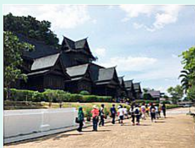
Students visiting the Malacca Sultanate Palace.