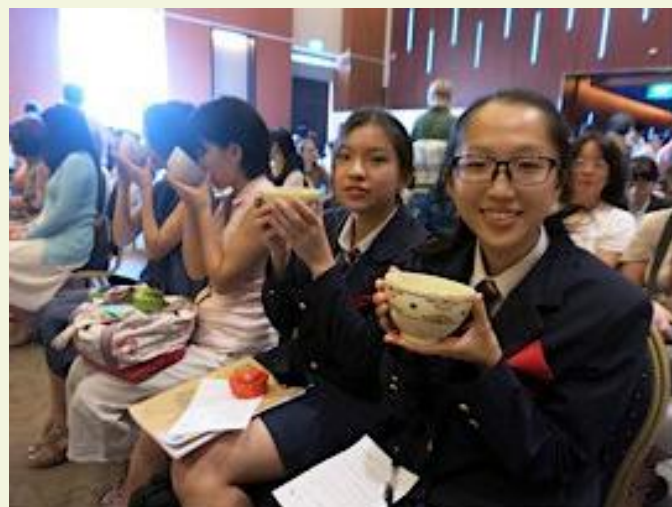
Enjoying our freshly-brewed green tea!