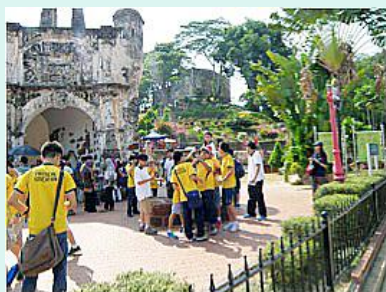
At the remains of the Portuguese Fortress of Porta de Santiago.