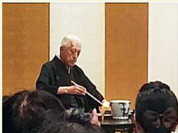
Dr. Genshitsu Sen performing the art of making Japanese green tea.

Going in and out of Starbucks on a daily basis, most of us know what matcha tastes like when it comes in latte form or green tea Kitkats. This brings forth the question: do any of us know the true taste of Japanese green tea?