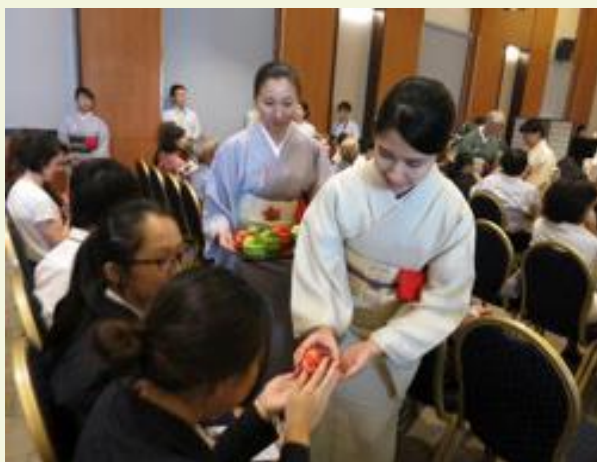
Women from the Japanese Creative Center in kimono, handing out Wagashi (Japanese sweets) to the guests.

Individual benefits aside, the Japanese Chado also unifies people as one of the requirements would be to enter the room with a bowed head; in Japan's older times, swordsmen had to shed their weapons in order to enjoy the ceremony, indicating equality according to Japan's ancient caste system. While such hierarchies no longer exist, the ritual is still observed for its implication of equal status and lack of discrimination against one another. This exhibition itself was beyond that of a normal tea ceremony demonstration, as it was a part of the Singapore-Japanese Goodwill programme.