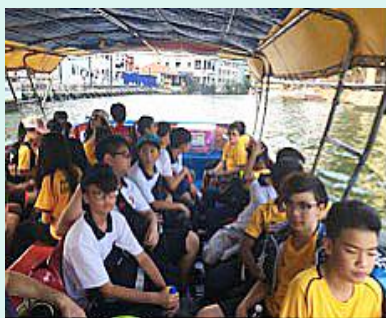
Evening cruise on the Malacca River, to imagine what it was like in the 14-15th Century.