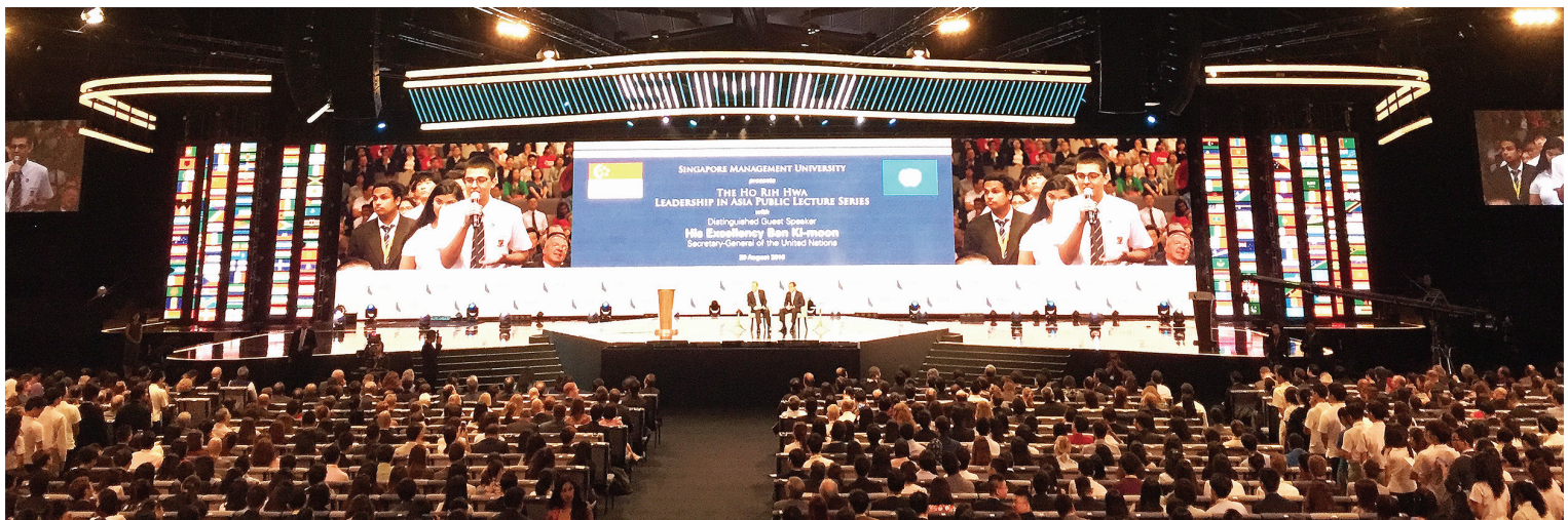
Ban Ki Moon photo with Dhruv