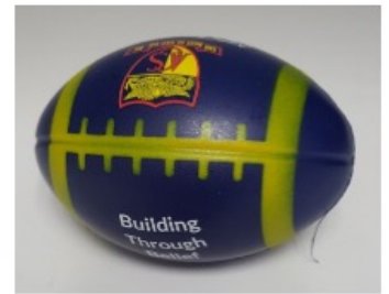
Stress Ball - S$2.00