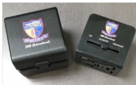
Travel Adaptor - S$15.00