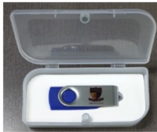
64GB Flash Drive - S$20.00