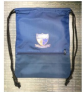
Drawstring Sport Bag - S$10.00