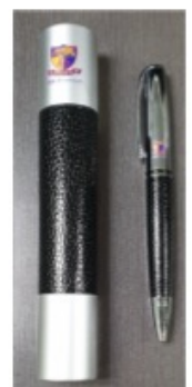
Ball Pen - S$12.00