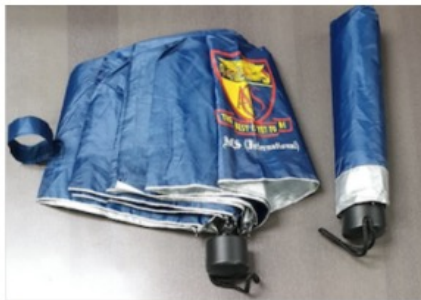
3-Folded Umbrella - S$12.00