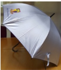
Long Umbrella - S$20.00