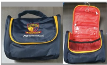
Travel Pouch - S$10.00