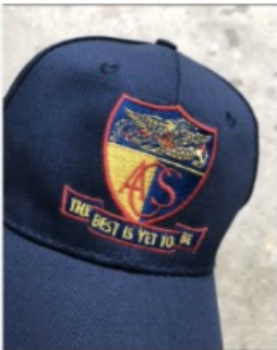
Cap - S$5.00

Please proceed to the Reception during office hours to purchase any of these items. Only cash or cheque payments are accepted.