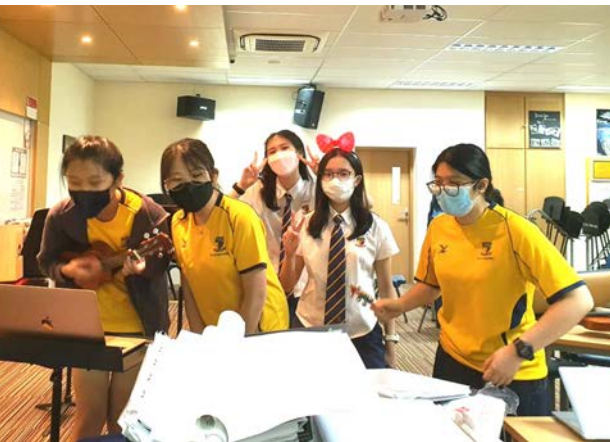
Expressing ourselves confidently and collaborating effectively