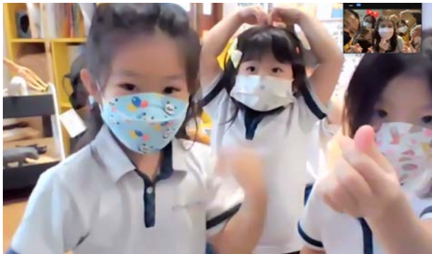
Expressing our care and love for one another