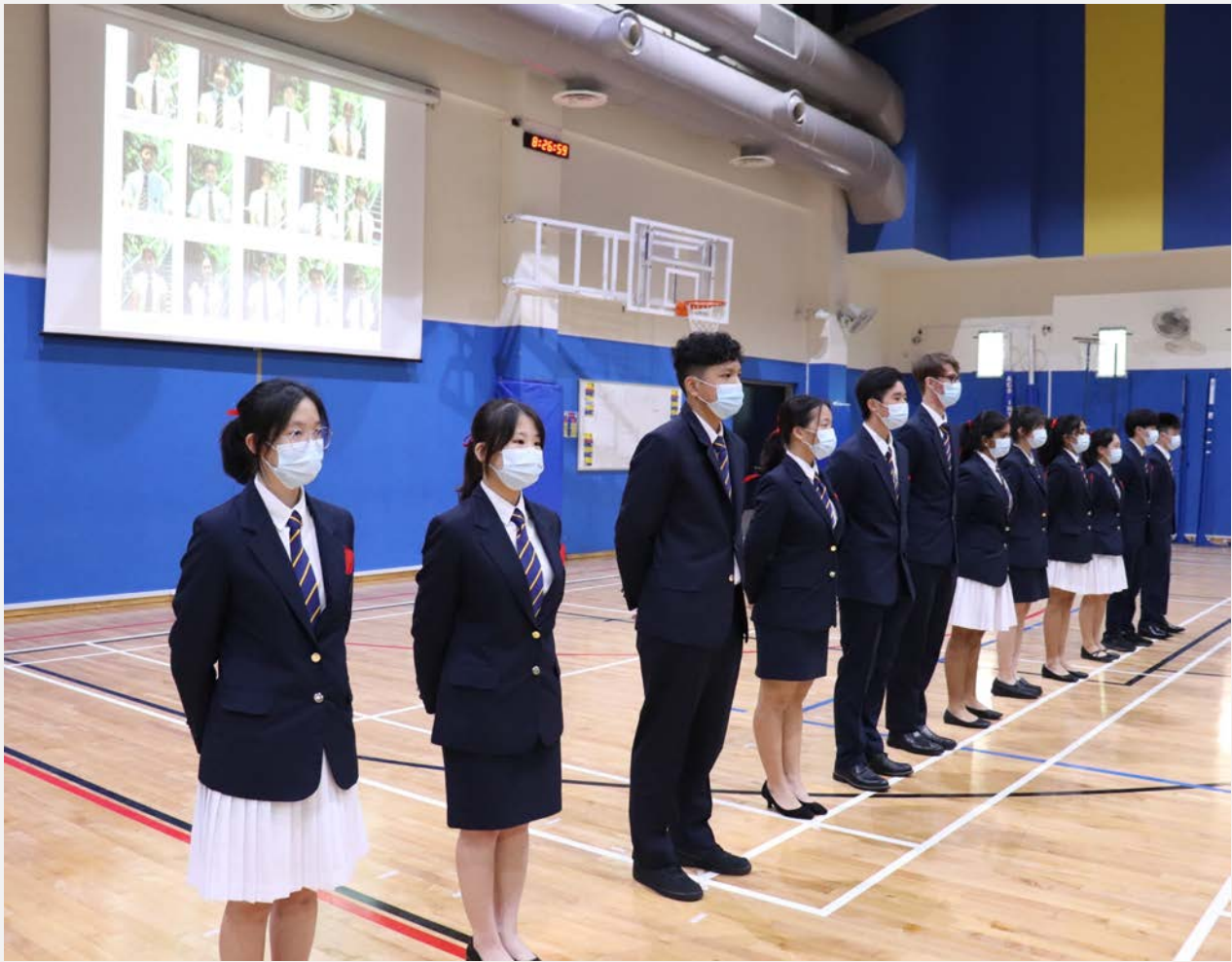
18th Student Council of ACS (International)

Our heartiest congratulations to all students who were involved in this year's Student Leaders' Investiture! The solemn yet pleasant ceremony, which took place on 27 April 2022, honoured the outgoing student leaders of the 17th Prefectorial Board as well as embraced the incoming 18th Prefectorial Board. May the new student leaders blaze the way forward for the school to new directions and heights as they lead us for the coming year.