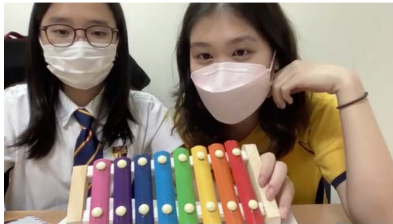
Taking up a challenge to teach the kids how to play the xylophone