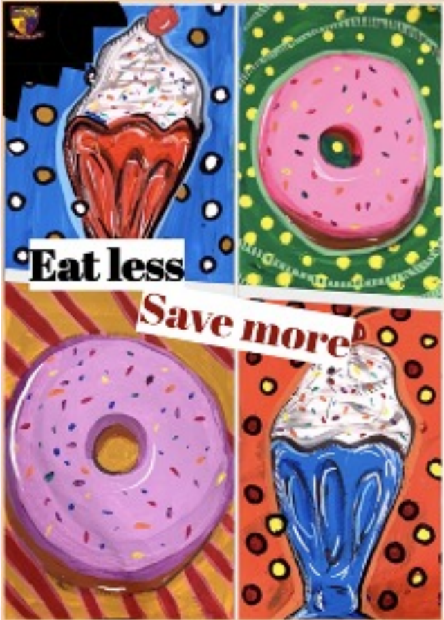
Danika 2X Poster Design on Food Waste