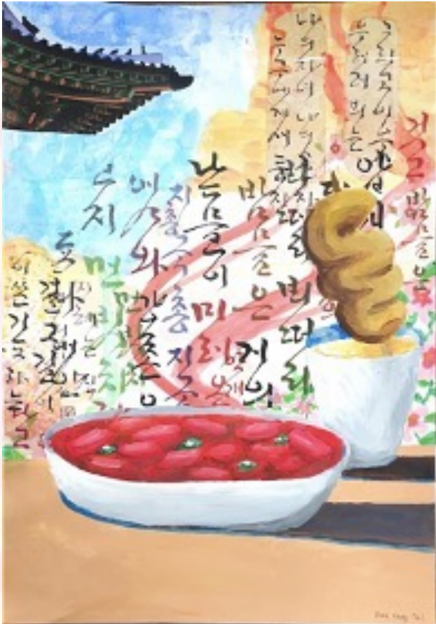
Dayon Pre-IG2 Pop-Art inspired painting on Food & Memories