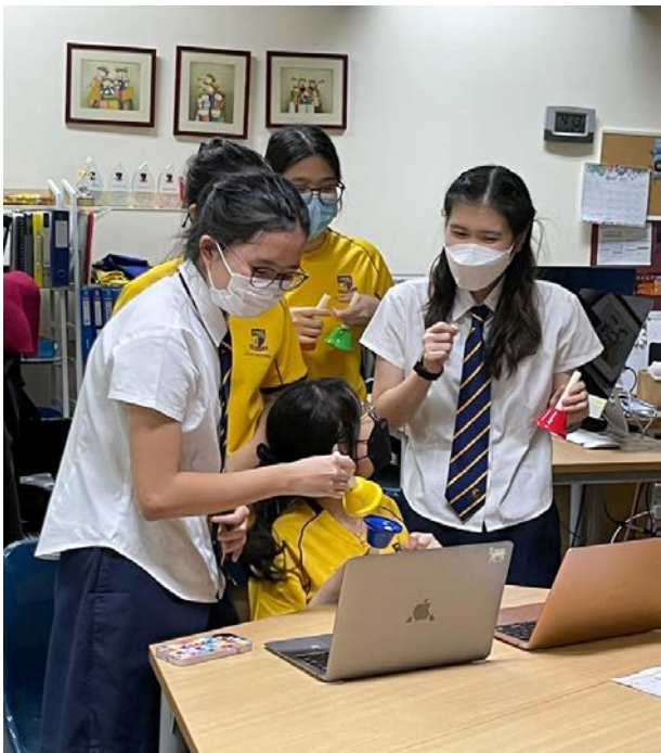
Using critical and creative thinking skills to impart knowledge to the children