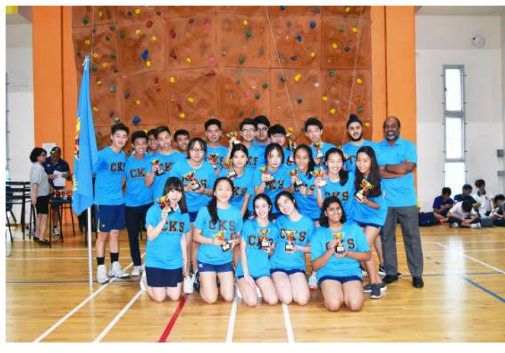
CKS Senior Division Champions