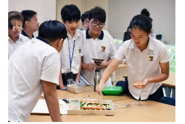
Learning how to order food at a Japanese restaurant

Only when our ears are open to the diverse languages around us will we be able to fully appreciate the beauty in our multilingual and multicultural setting. A toast to the eventful Language Week - Saluti .