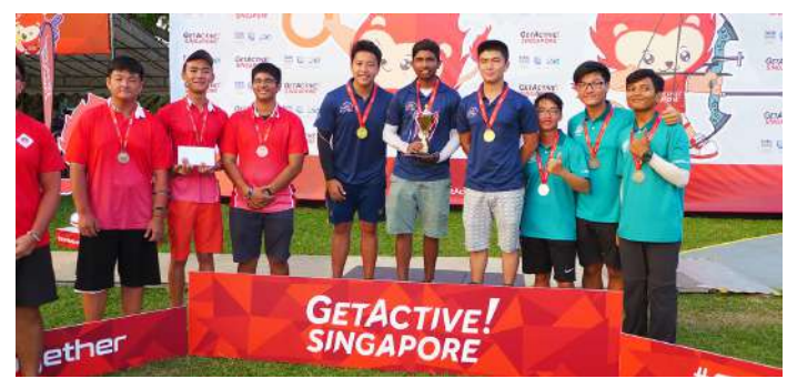
Gold, Silver and Bronze Teams in this category