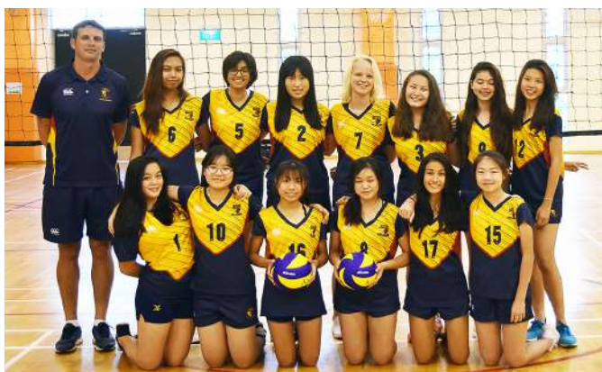
ACSIS 14U Girls Volleyball Team