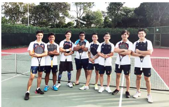
ACSIS 19U Boys Tennis Team