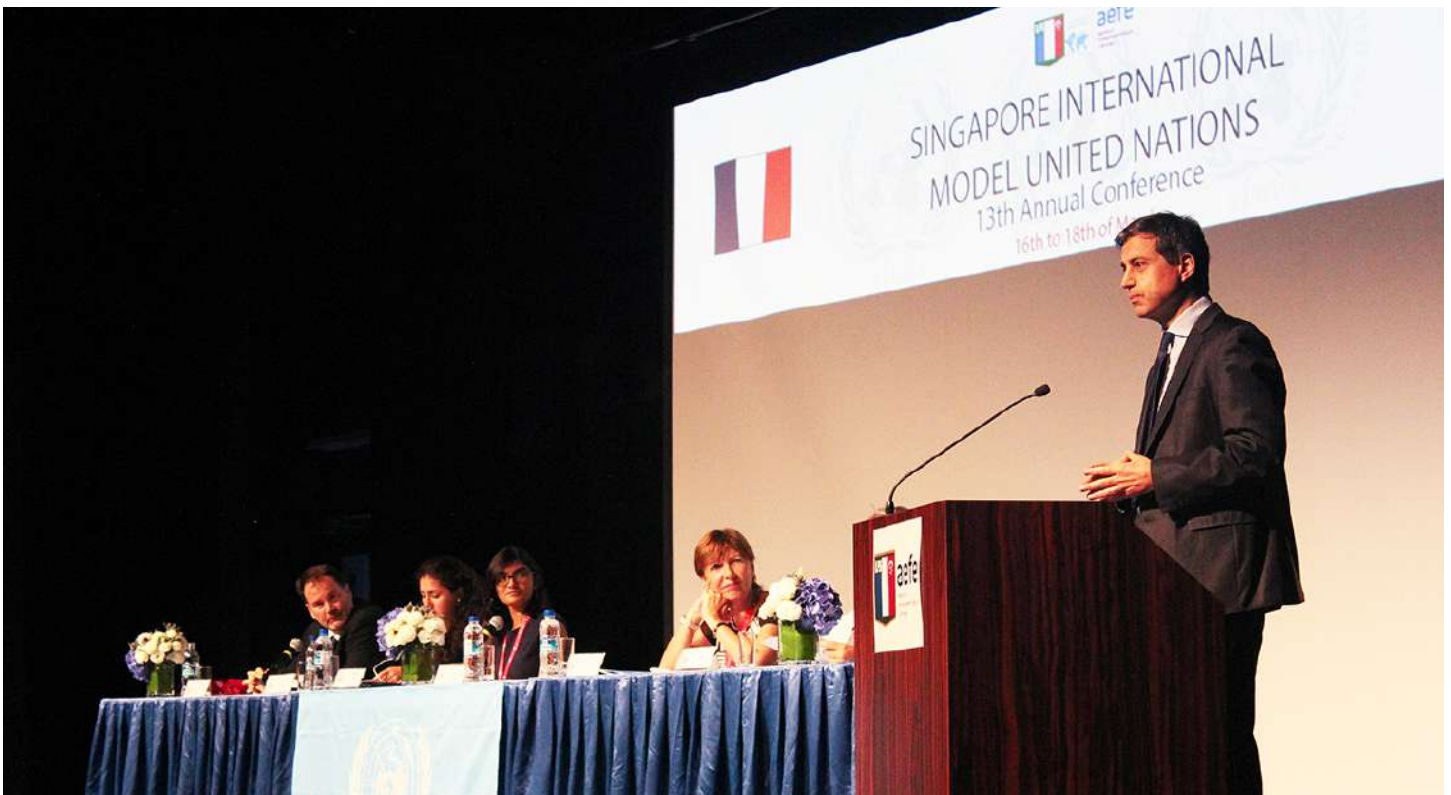
SIMUN Opening Ceremony