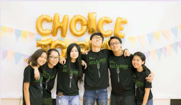
Our Student Ambassadors | World Vision | Tien Lu Vietnam

https://www.facebook.com/ACSInternationalSingapore/photos/pcb.1636867692995226/1636863066329022/?type=3