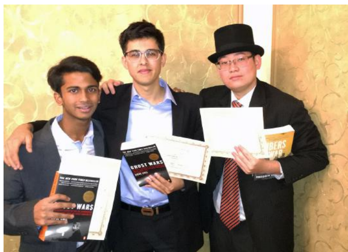
Our Outstanding Delegates awardees