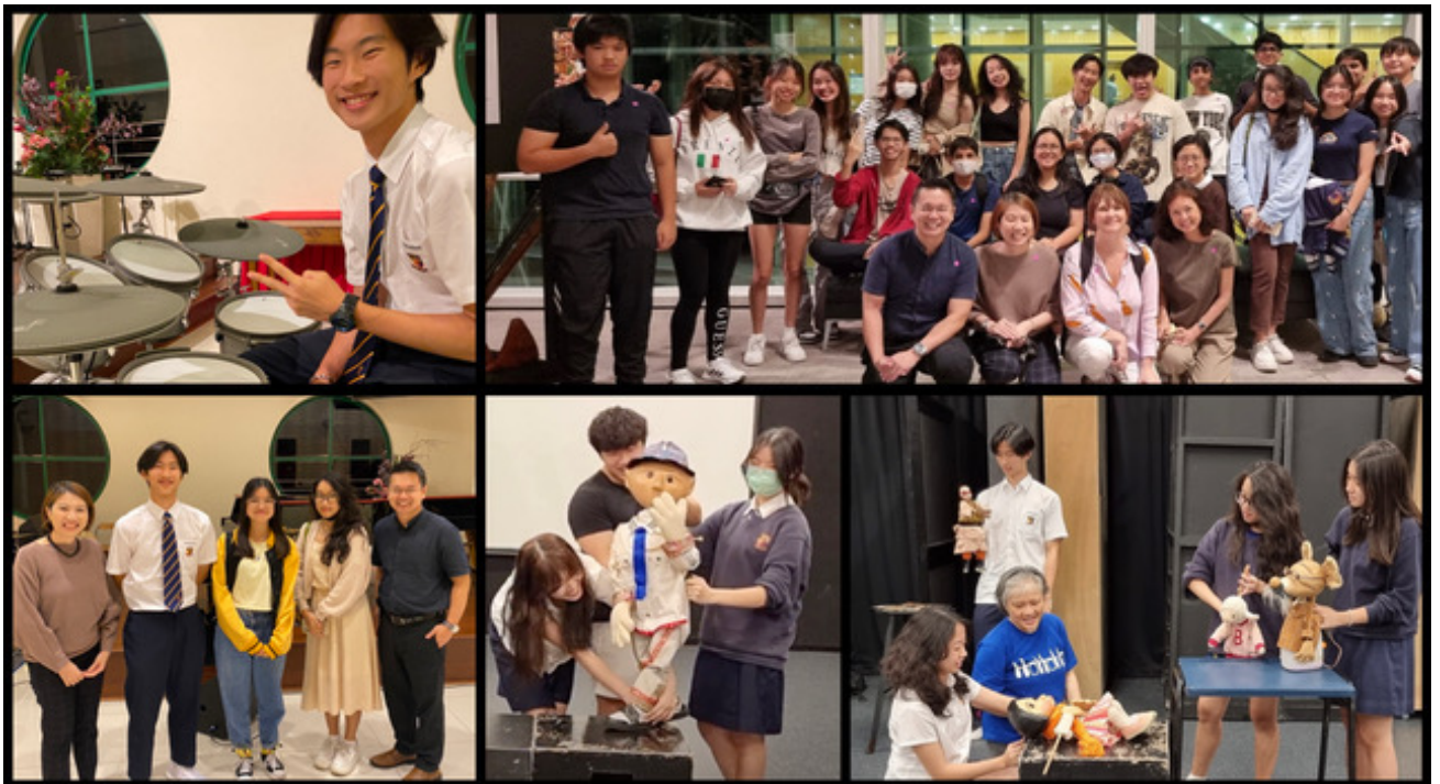
Past arts and music activities participated