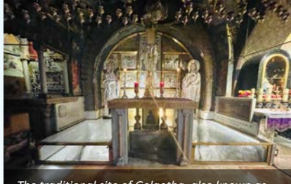
The traditional site of Golgotha, also known as Calvary, where Jesus Christ was crucified.