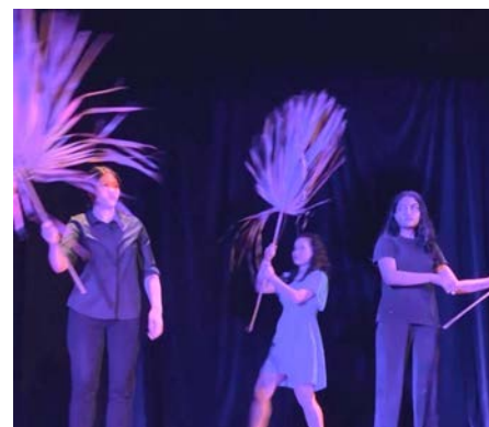
Contemporary Music Maker: Collaboration to compose music for a short film