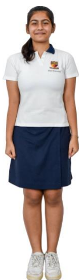
ACS Polo Shirt (Female)