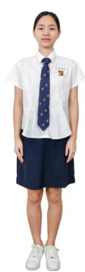
Female Chapel Attire (Years 1 to 4)