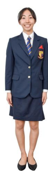
IB Formal Attire (Female)