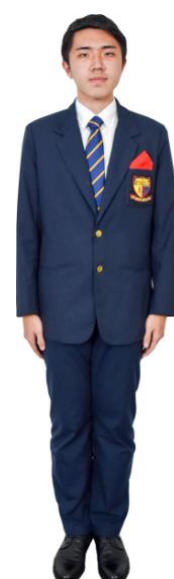
IB Formal Attire (Male)