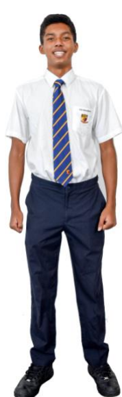
IB Chapel Attire (Male)