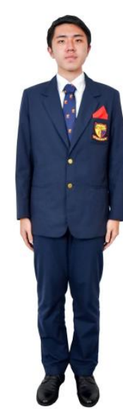
Male Formal Attire (Years 1 to 4)