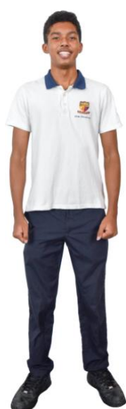
ACS Polo Shirt (Male)