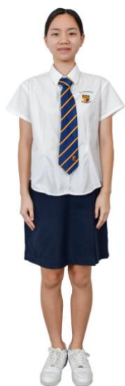
IB Chapel Attire (Female)