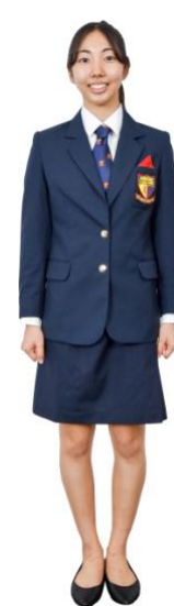
Female Formal Attire (Years 1 to 4)