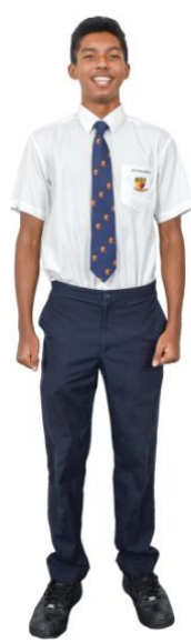
Male Chapel Attire (Years 1 to 4)