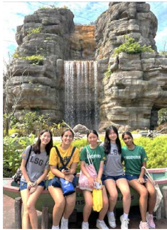
Interact Club Student EXCO & Teachers

Our families and Interactors had a meaningful time bonding and engaging with each other, while learning about the different species of birds in our award-winning Singapore Bird Paradise.