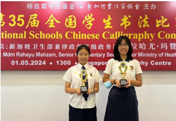
35 th National Schools Chinese Calligraphy Competition