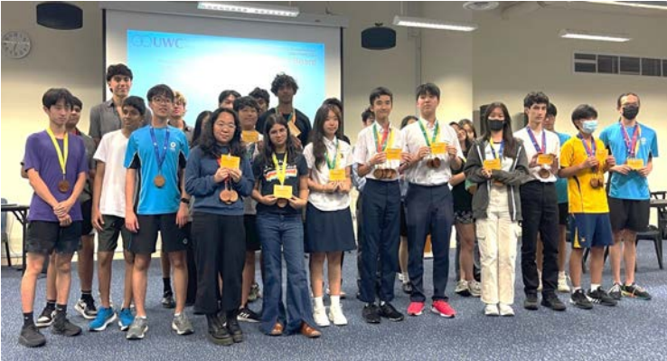
WMC Golden Ticket Winners