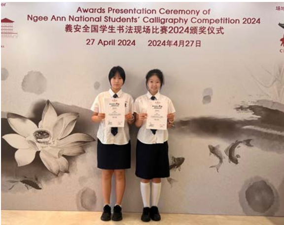
Ngee Ann National Students Calligraphy Competition 2024