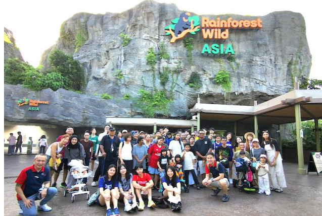
Interact & Sustainability Club Student EXCO & Teachers

Our families and Interactors had a meaningful time bonding and engaging with each other, while learning about the different species of animals in Singapore's newest tourist attraction.