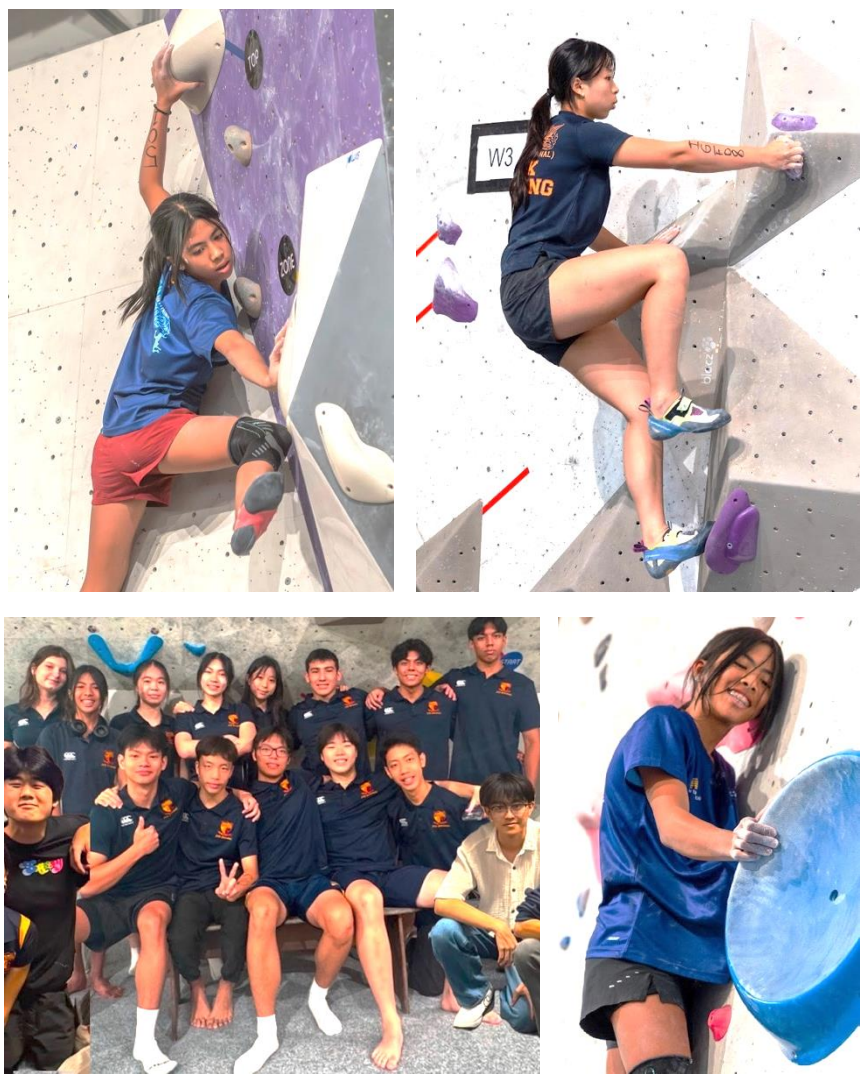
The Rock Climbing CCA Class of 2025