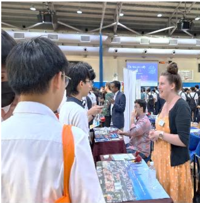
University of Chicago