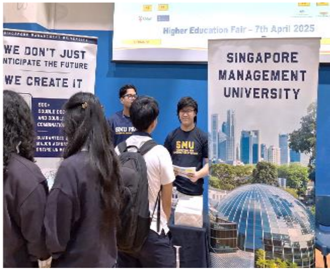
Singapore Management University and our Alumni