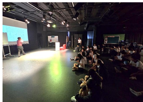
More than 60 students attended the MathMagic Workshop